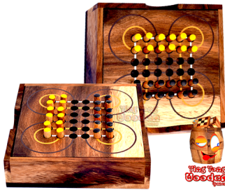
Surakarta Roundabout Game as wooden box with wooden plugs for travel Monkey Pod wooden games