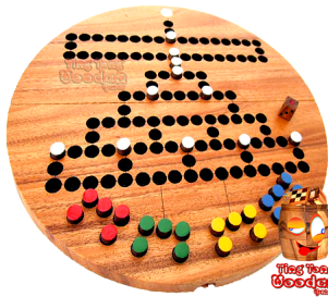
Barricade Malefiz as round game board version from Monkeypod wood Thailand Chiang Mai