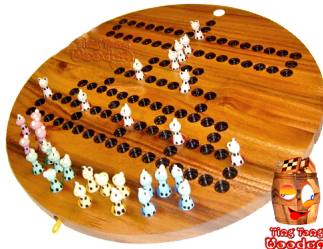
Barricade Frog The Malefice Dice Game as a wooden board game with ceramic frogs and wooden dice